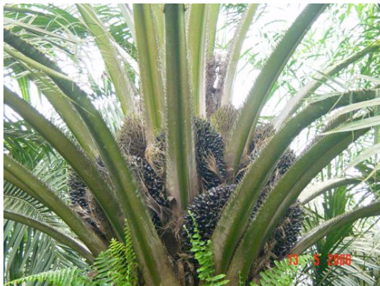
Oil Palm in Jambi estate

Comparison of yield between 2006 and 2007 – a year after TERRA application.