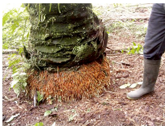
Increase in roots volume

The TERRA application will not interfere with the current fertilizer application program whatsoever for the oil palm tree. The current fertilizer program should be maintained.