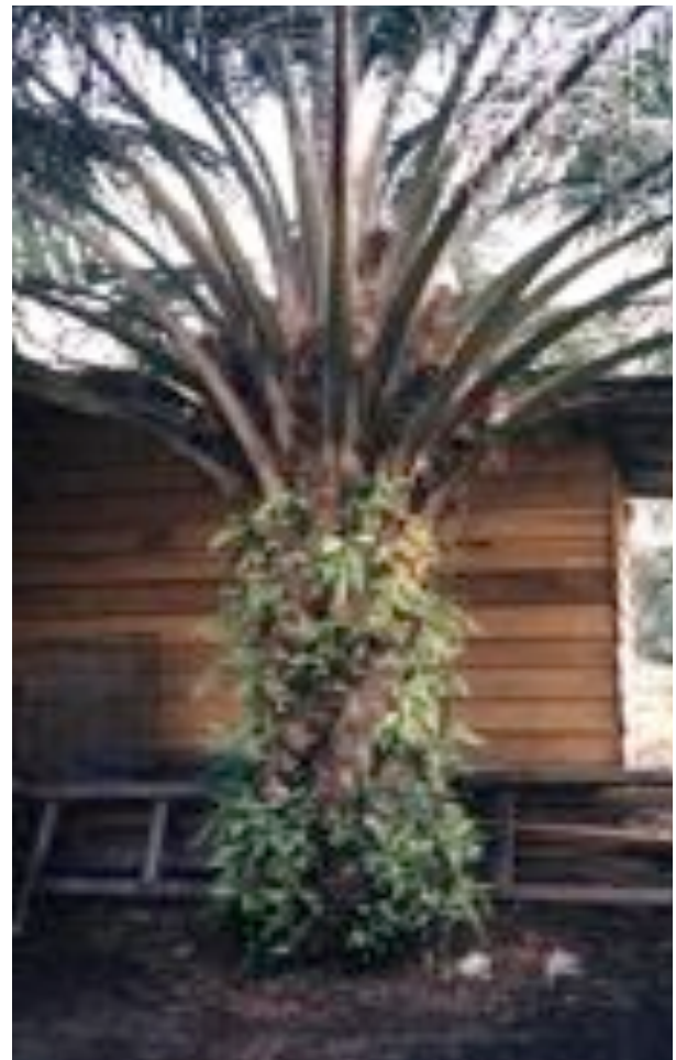
Oil Palm in Riau Estate

Application of novelgro TERRA will increase your plantation productivity up-to 35% and only cost a fraction of it.