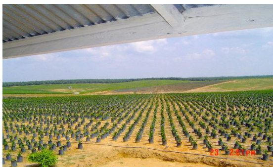
Oil Palm in South Sumatera Estate